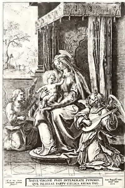
Figure 20. Madonna and Child with Angels , by Antoon Wierix (1552–1624) after Martin de Vos (1532–1603). Flanders, 1584. Engraving. Royal Library of Albert I, Brussels